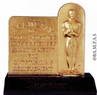
The Motion Picture Academy's Scientific and Engineering Award ("Academy plaque").

Dolby has been previously honored by the Academy with Scientific and Engineering Awards in 1979 and 1995 for the original